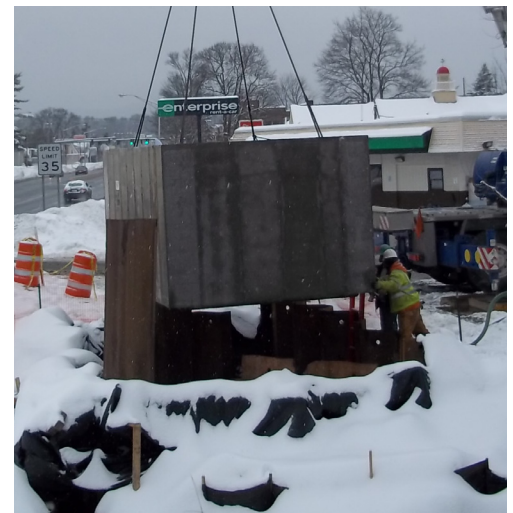
Installation of new storm water filtration device in January.

Previously, all the storm water run-off from the Aviation Mall area flowed to the intersection of Aviation Road and Route 9, eventually entering Halfway Brook near Price Chopper. Under the new system, the solids (trash and other debris) are captured, and only water filters into the brook, said Dave Wick, District Manager for Warren County Soil and Water.