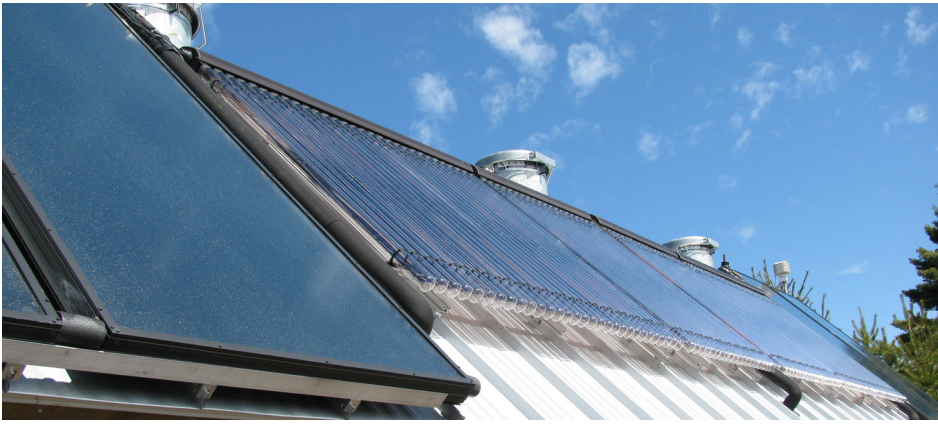
Here comes the sun: Solar panels at The Wild Center are part of a solar thermal hot water heating system.